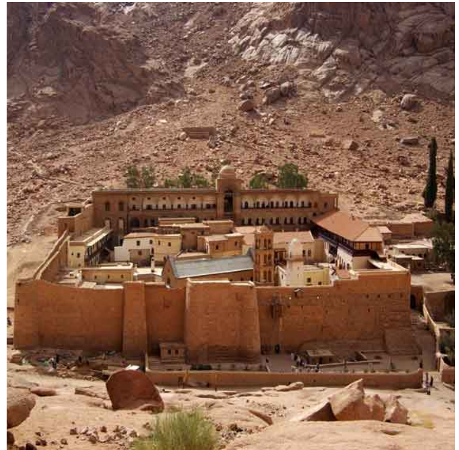
Monastery of St. Cathrine (found in 548 and 565 AC) submontane of the Mount Sinai