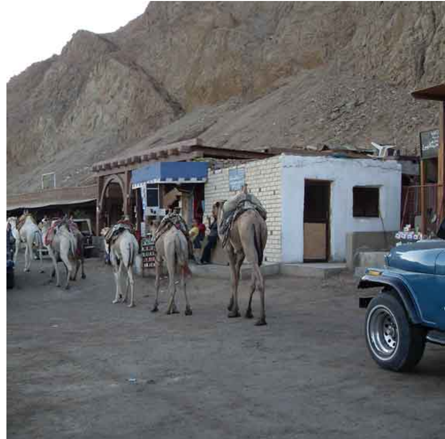
Break at „the Blue Hole“ The team meets a camel caravan of a local resident bedouin clan. „Blue Hole“, approx. 18.5 miles north of Dahab.