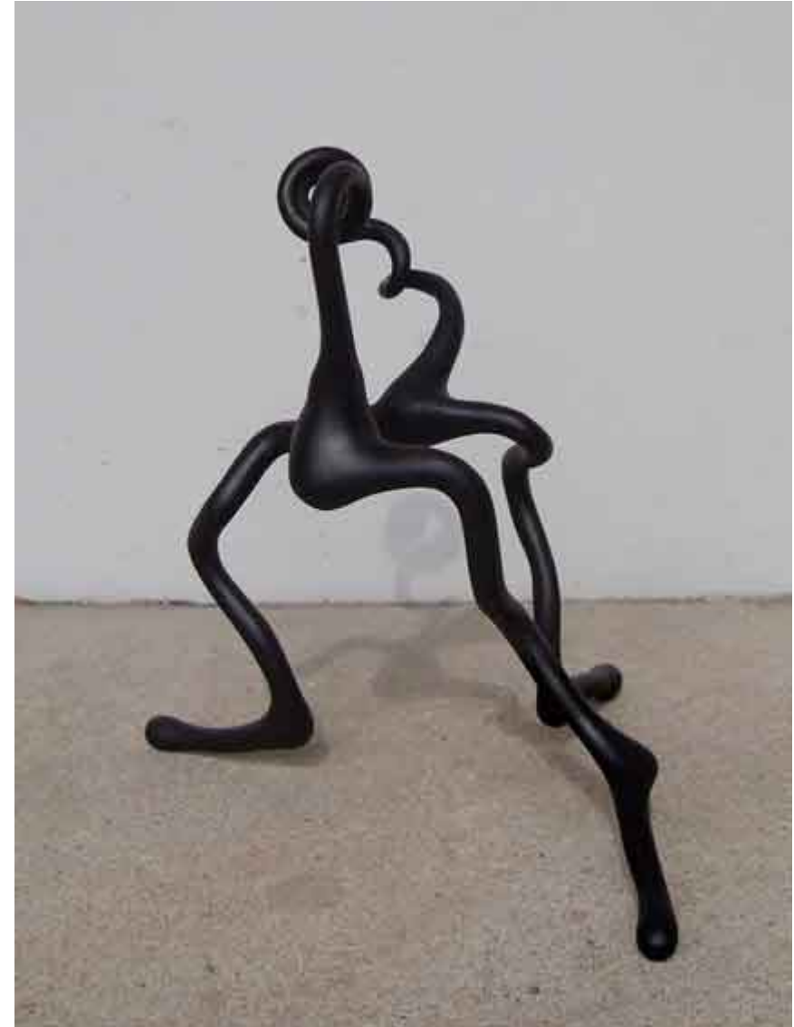
Ruemperien # 10.191

They are very shy and show themselves to humans only rarely. But their natural curiosity let them penetrate into human homebound units again and again.