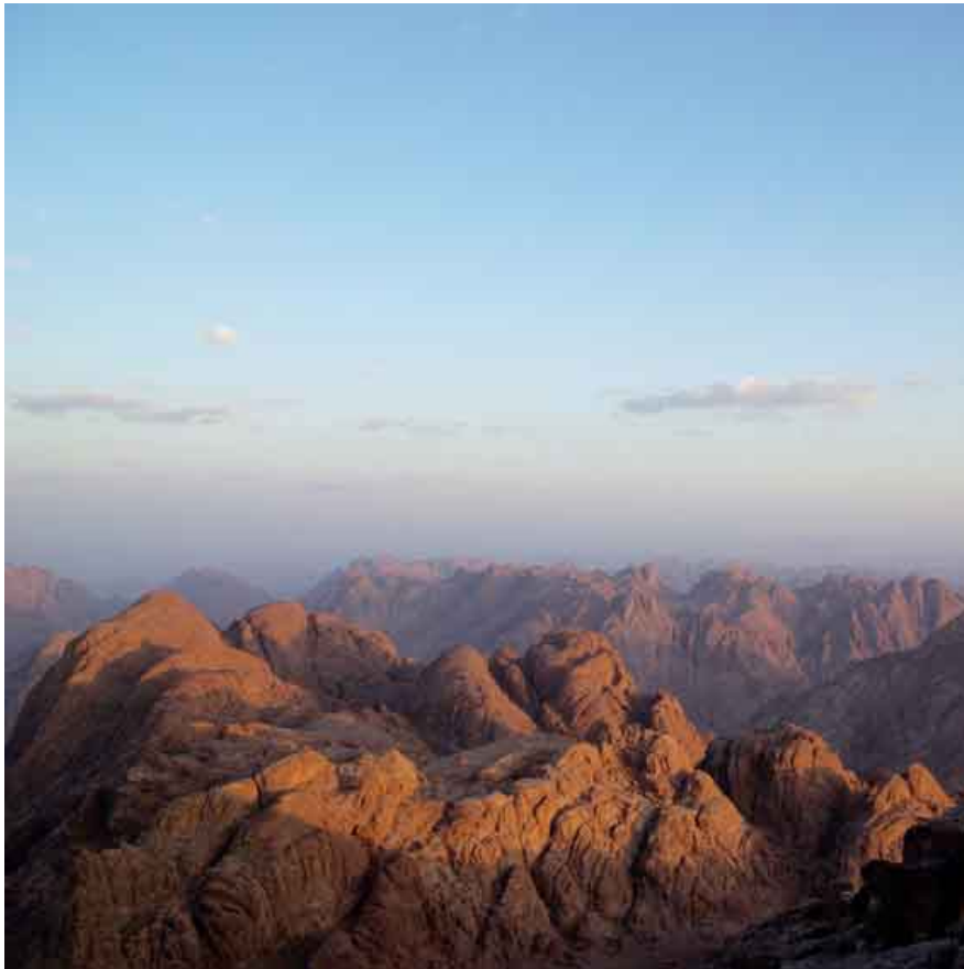
The Mount Sinai, approx. 2500 yd high

Beside Jewish and Christian pilgrims, both places were visited also from Muslim Believers because for many Muslims the Sinai mountain has its religious meaning too as the place, from where Mohammeds horse Boraq ascended to the sky.