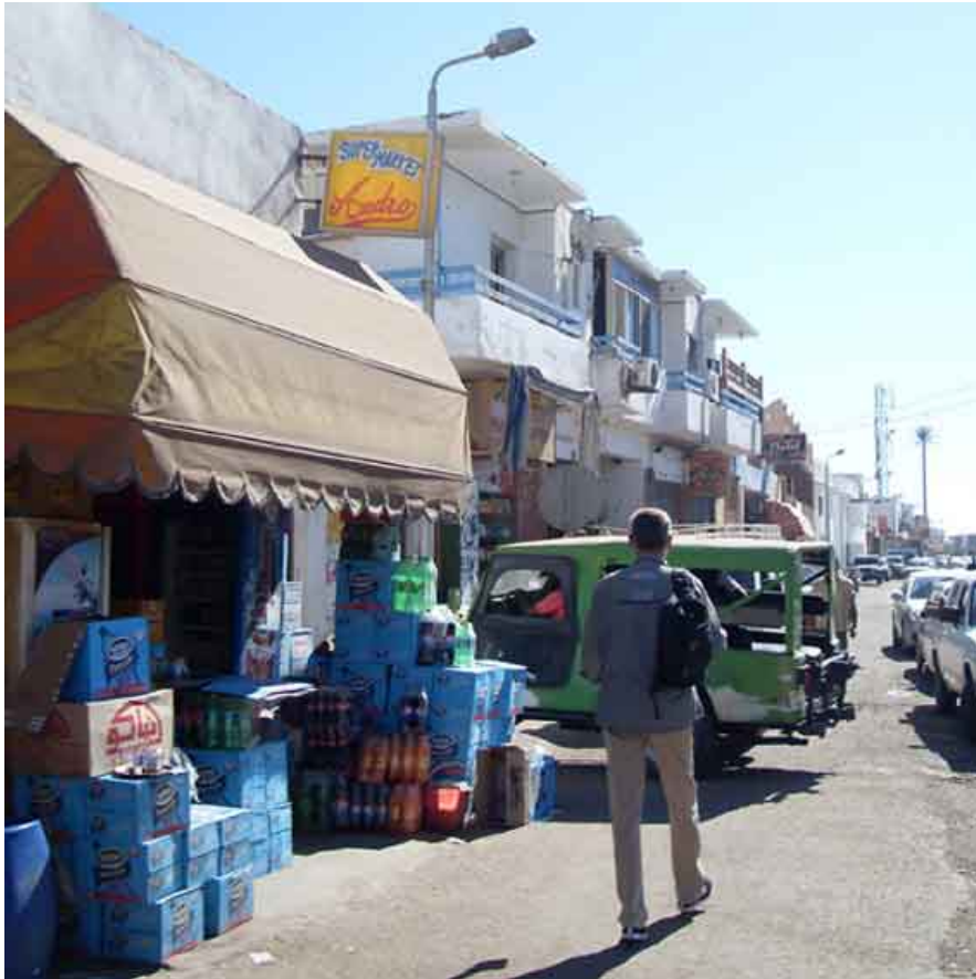
Departure on the next morning in Dahab. Arrival of the desert jeep, November 19th 2011 around 6.15 a.m.