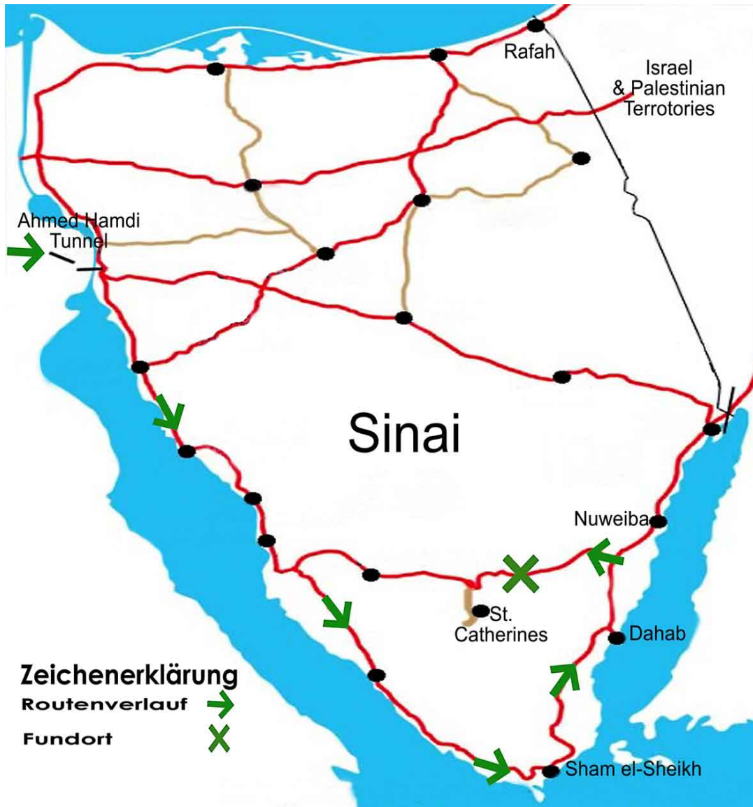
Streetmap of Sinai Peninsula

After arriving in Cairo the team took the road through the Ahmed Hamdi tunnel and the western coastal road down to Sham el Sheikh, to drive further on the eastern highway to Dahab. After a one-day break in Dahab they started toward Nuweiba, up to the side road to the Saint Catherine's Monastery and Mount Sinai. On this distance section, not far away from this road they discovered the fossilised Rümperien.