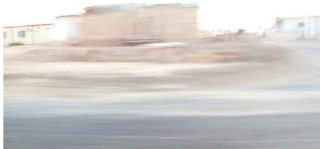
Photos from 11-11-2011 Desert highway between Dahab and Saint Catherine's Monastery