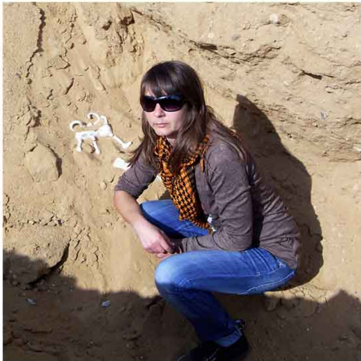
The artist and the finding

On Nov 19th 2011 at 12.42 p.m. a fossilised Rümperien was found in the Sinai desert.