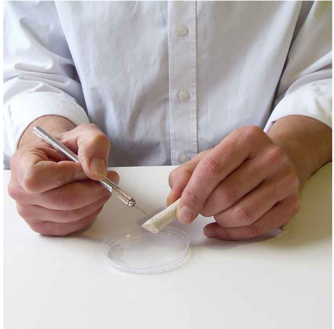
Employee of the laboratory extracting a particle of the fossilised find

With the help of the carbon dating method the age of the fossilised Rümperien could be dated on 1330 BC.